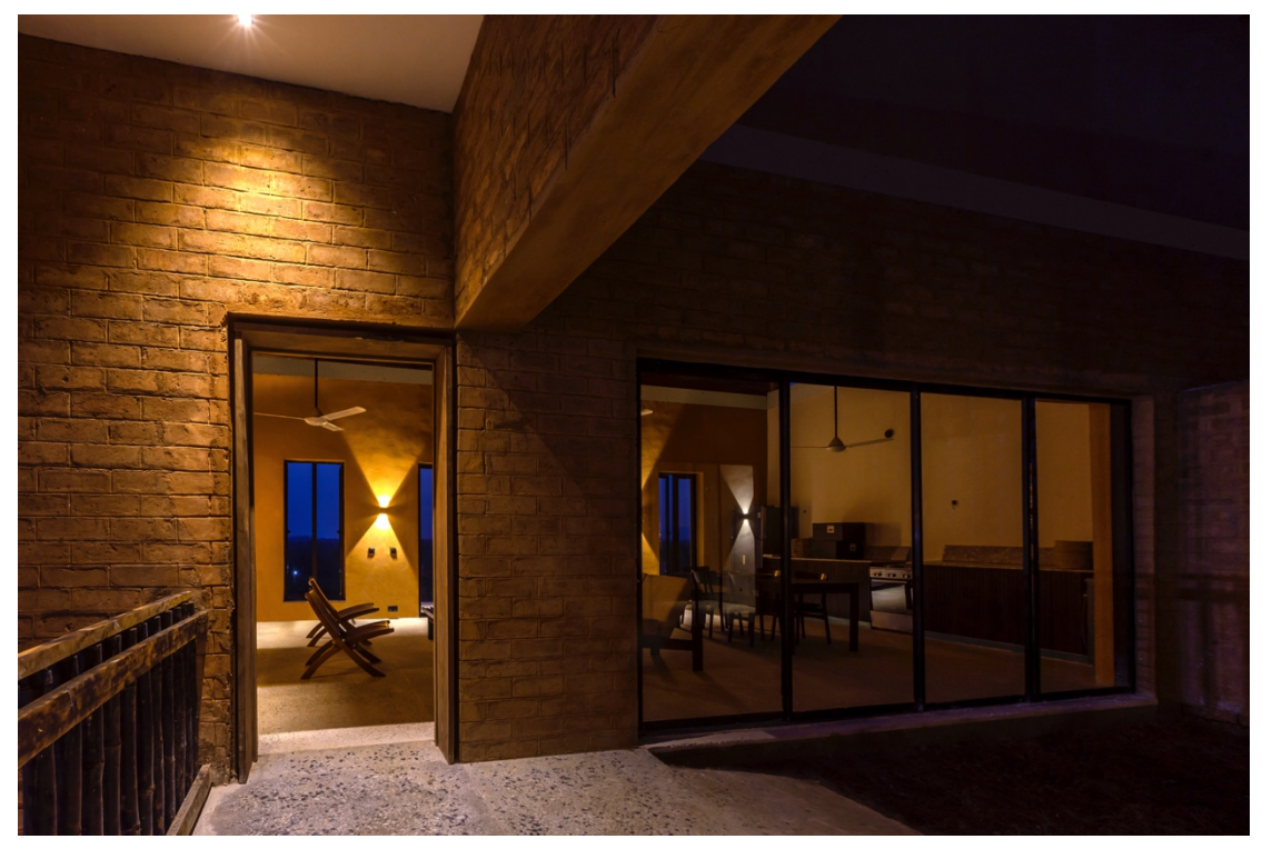
View of the open plan living room and kitchen area.