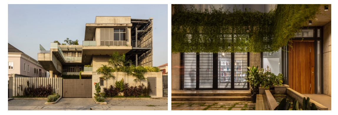
G.A.S. Lagos building exterior (L) and courtyard (R).