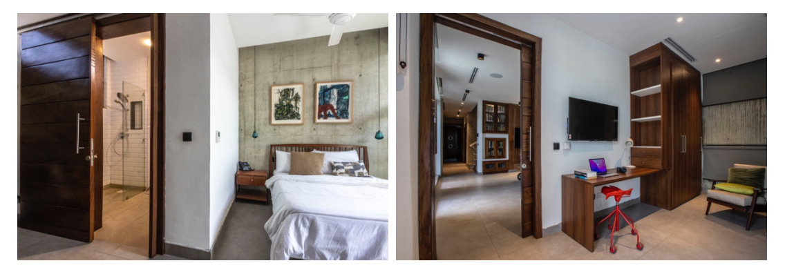
Resident bedroom one.