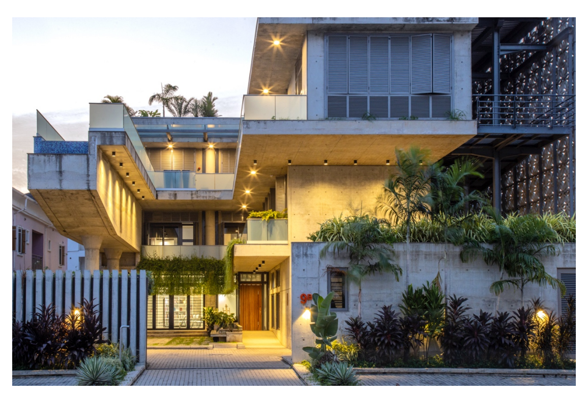
G.A.S. Lagos residency building.

The first is based in Lagos, one of the most enterprising cities in the world. Here, the Foundation is hosted in an award-winning building in Oniru designed by Ghanaian-British architect Elsie Owusu in collaboration with Nigerian architect Nihinlola Shonibare of Lagos-based practice, NS Design Consult. The building houses a multifunctional studio/ gallery space on the ground floor, with accommodation and shared living space on the first floor for up to three artists-in-residence with a 'barrier-free' design to ensure access for all users.