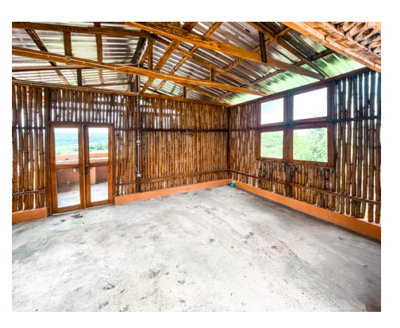
External wet studio porch view (L) and work/studio room (R).