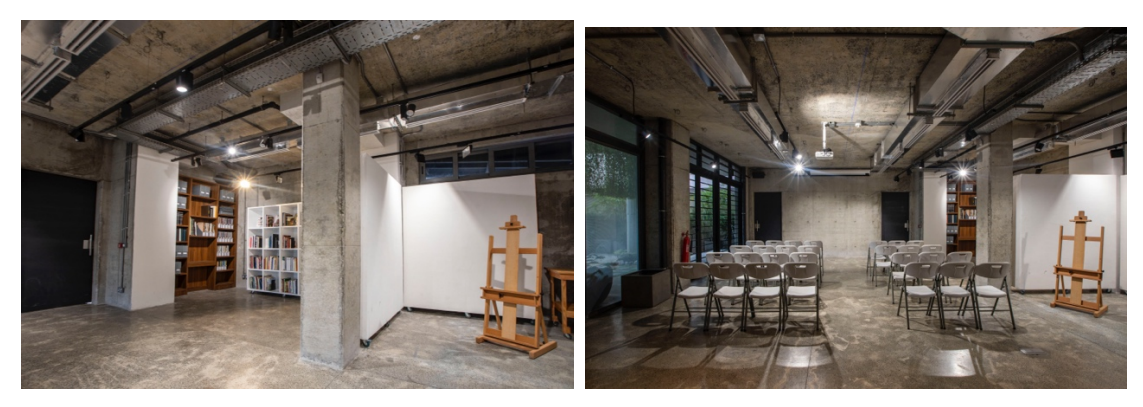
Ground floor multifunctional project space.