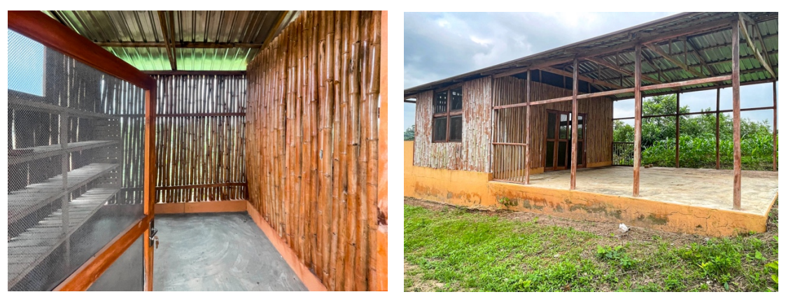
Materials storage room with shelving (L) and exterior view of the wet studio (R).

Please note there is currently no electrical lighting or access to power in this studio therefore working hours should be during the day when there is daylight. If you think you will require power, please raise this with the Residency Manager during your onboarding sessions.