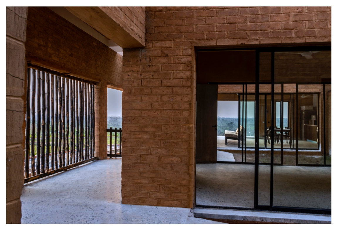
View of the internal studio from the internal courtyard at the G.A.S. Farm House.