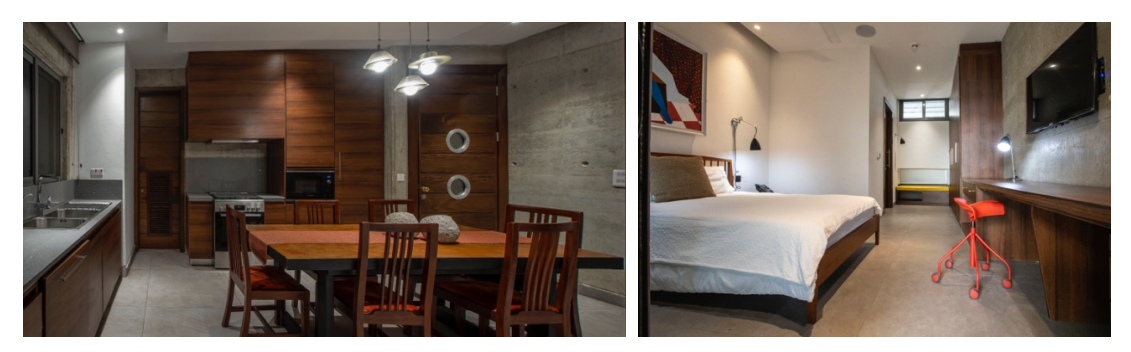
Resident's kitchen (L) and resident bedroom two (R).